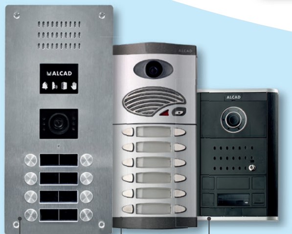
iVANDAL entrance panels